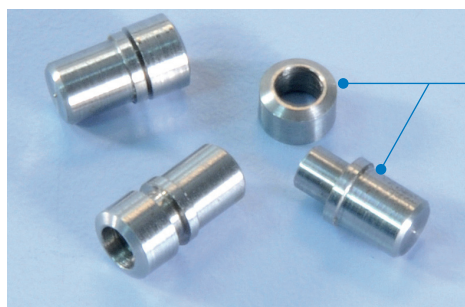
242.047 Speed Drive Polini/Piaggio 50