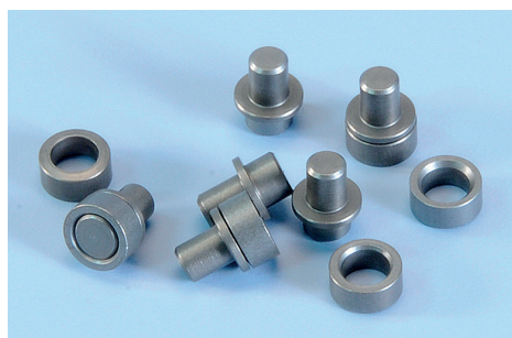
242.049 Yamaha TMAX 500/530

Lubrificante solido in grado di ancorarsi saldamente alle superfici lubrificate e riempire le cavità microscopiche.