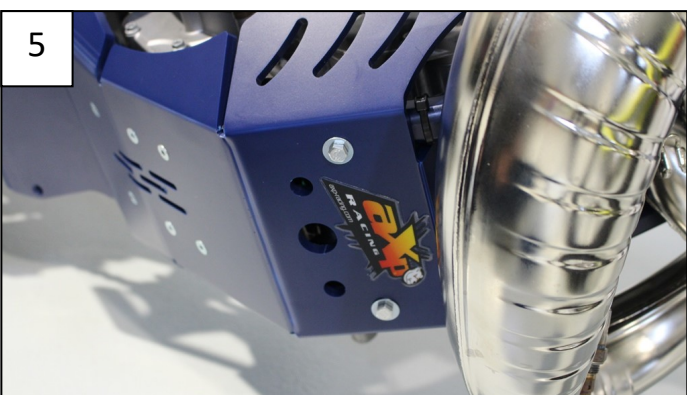
5 Fix Th6x26mm + M6 Large washers into the frame