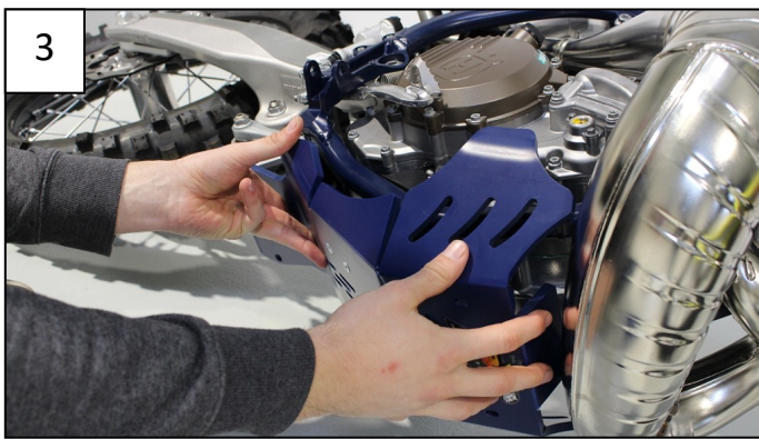
3 Clip the rear of the skid plate on the rear tube