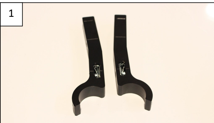
1 Put the clamped bolts into the plastic mounts

AX1571 XTREM SKID PLATE BLUE HUSQVARNA TE250i-300i