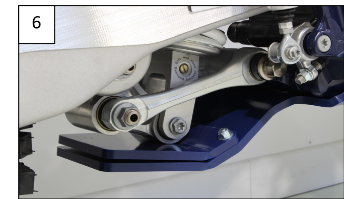
6 Fix the plastic plate with the Tfhc 6x25mm + M6 Washers + em6f