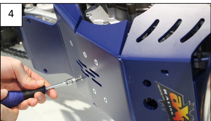
4 Fix the 2 last Tfhc 6x30mm