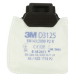
D3125 P2 R