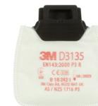
D3135 P3 R