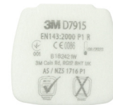
D7915 P1 R