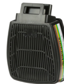
D8094 ABEKP3 R