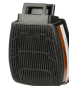
D8095 A2P3 R