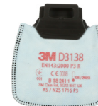
D3138 P3 R/ Nuisance* Organic Vapour & Acid Gas