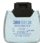
D3128 P2 R/ Nuisance* Organic Vapour & Acid Gas