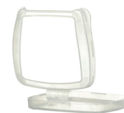
D701 Filter Retainer

HF-800 Series half mask and associated filters have an inhalation breathing resistance of less than 5 mbar, when measured at 95 lpm continuously. *Nuisance levels refers to concentrations not exceeding applicable government occupational exposure limits.