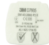
D7935 P3 R