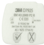
D7925 P2 R